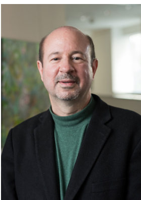
Michael E. Mann PhD.